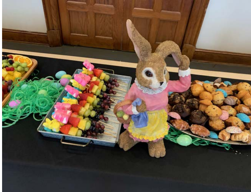
FIRST PRESBYTERIAN CHURCH OF OKLAHOMA CITY