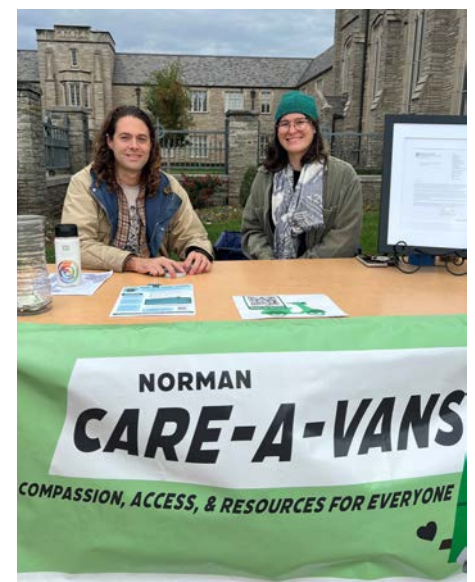
We had some amazing organizations present at the festival! Thank you to the Oklahoma Innocence Project, Norman Care-A-Vans, and our very own SPARK for participating.