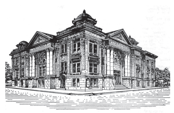
9th & Robinson

By 1907, the church had grown to 500. Rev. Phil Baird was called to be pastor, and the church flourished. The 6th Street Church soon proved inadequate. On September 25, 1909, the cornerstone for a new building was laid at N. Robinson and 9th Street.