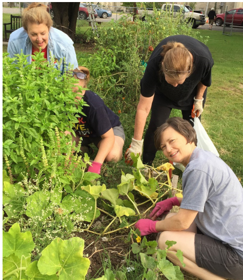
A recent Reserve the 3rd volunteer time in our Community Garden.