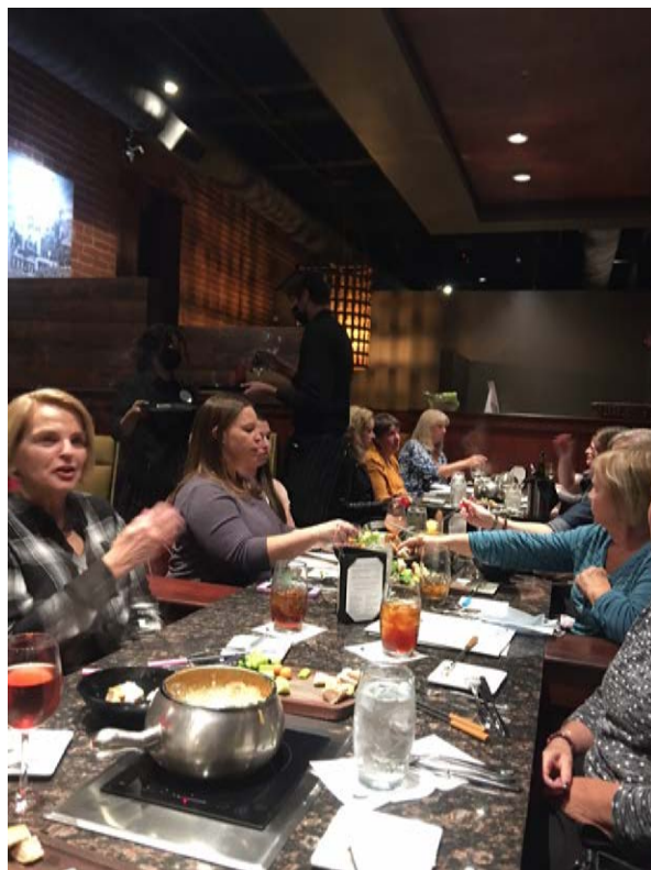
PW enjoying some food and fellowship at the Melting Pot last month!